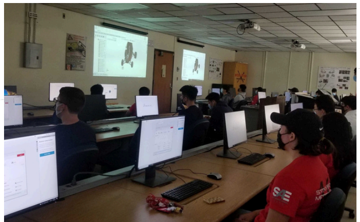
At one of our CAD lessons, students learn the basics of 3D modeling and simulation. They will use these skills to design and validate their own parts.