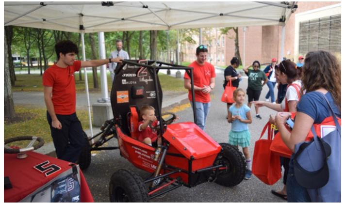
We brought our car to Community Day, an event where visitors of all ages learn about the university's programs and traditions. Members of the community loved hearing more about our organization and taking pictures with our car!

This year we plan on attending the Williamsport event. This competition includes a 4 hour endurance race as well as a design and sales presentation, hill climb, suspension & traction and maneuverability.