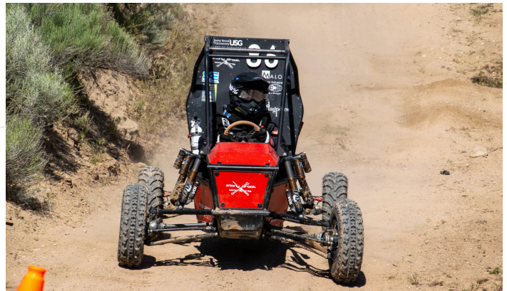
The bright red body of our car (and the partners featured on it) are easy to spot in the dusty four hour endurance race at California.

If you are interested, please review the enclosed partnership form. If you have any questions, our contact information is on the back of this packet.