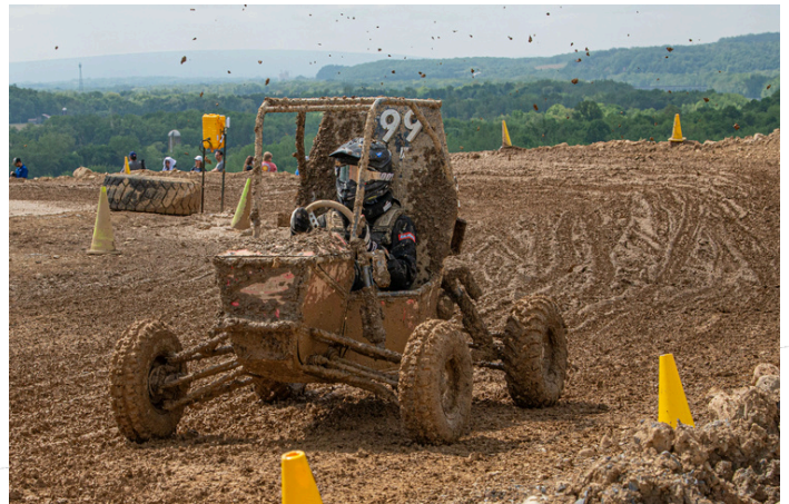
In 2024, we placed 13th place in maneuverability at California and 10th in endurance at Pennsylvania.

Students of all majors, years, and experience levels are welcome to join. Team members train and guide new members, from teaching introductory Solidworks lessons to organizing mock competitions. Our alumni recognize the positive impact Baja has had on them, volunteering their time and knowledge to advise us.