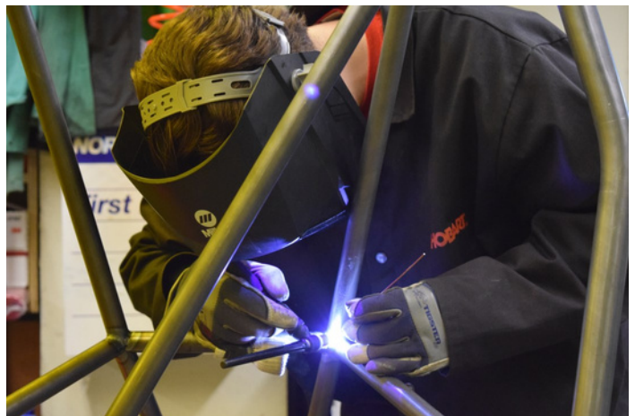
A new tubular frame chassis is created every year. Students notch and weld all of the tubes themselves in our machine shop.